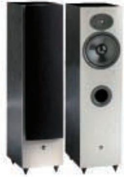
AS-F1 Floorstanding Speakers